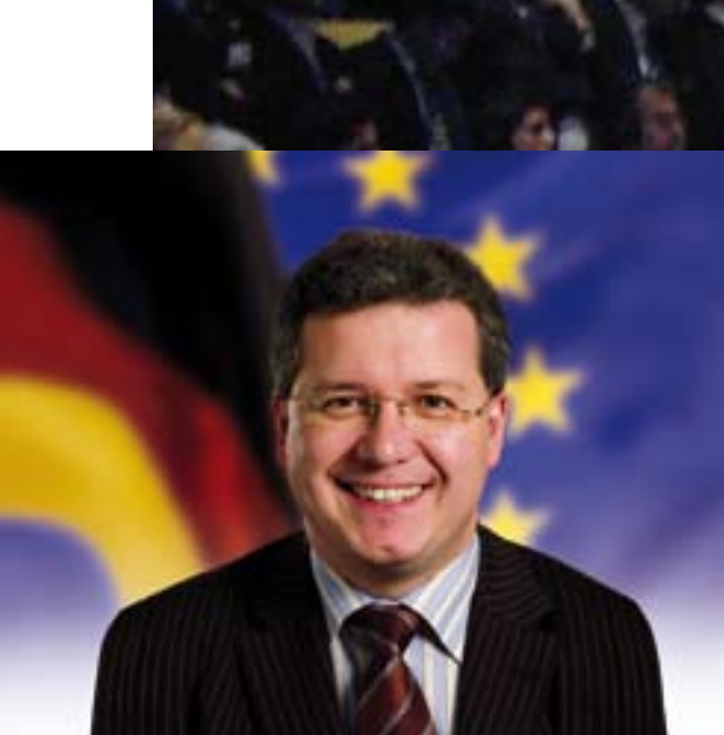
Markus Ferber, EVP-ED Member of the European Parliament